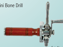
Mini Bone Drill