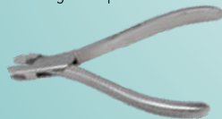
Plate Bending Forceps - Modified