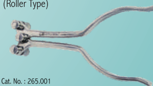
Plate Bender for Reconstruction Plates (Roller Type)